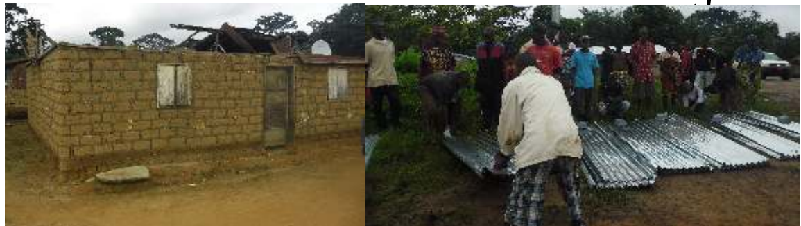
(L - R) A deroofed building by storm and NDRC Staff distributes zinc

he National Disaster Relief Commission, NDRC, at the Ministry of Internal Affairs, has given non-food relief items, particularly building materials to several storm and fire victims in Bong and Lofa Counties.