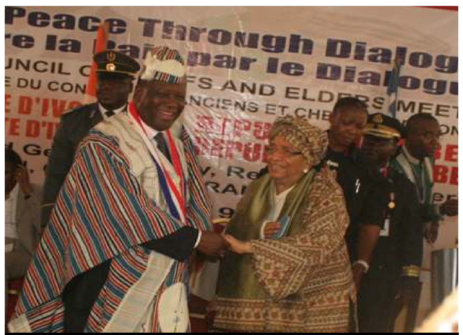
President Sirleaf congratulates President Ouattara moments after the Ivorian President was gowned by Liberian Chiefs and Elders in Zwedru, Grand Gedeh Count on October 19, 2013

hiefs and Elders of Liberia and La Cote d'Ivoire are gearing up for a second round of peace and reconciliation meeting following the successful conclusion of the just ended Joint Council of Chief and Elders Meeting (JCCEM) in Zwedru, Grand Gedeh County.